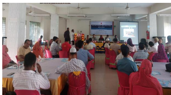
Activity 4.Voice message broadcast for Sundarganj, Gaibandha